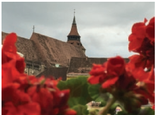
The black church in Kronstadt