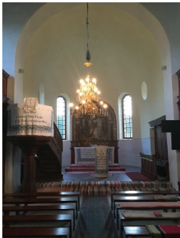
Inside of the church in Kreischi