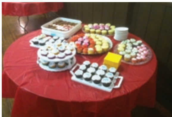
Cupcakes (above) and Door Prizes (below)

were delicious cupcakes to finish off the meal and an array of gift baskets and gift cards as door prizes. If you missed it this year, we hope to see you next year. Please mark your calendar for our next event, our Annual Trachtenball on May 4. Please see our ad for more information.