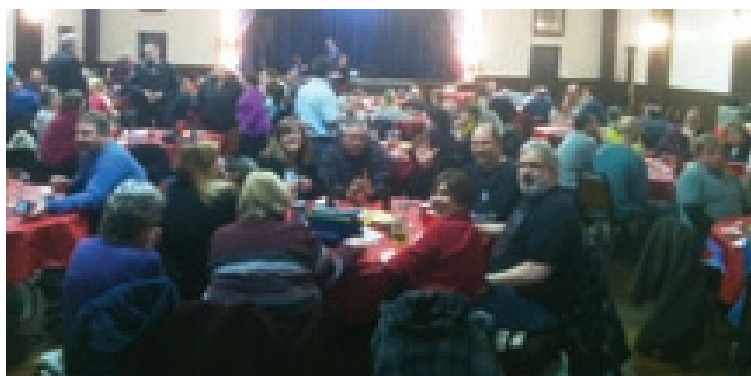
Chili lovers having a good time at the Cook Off