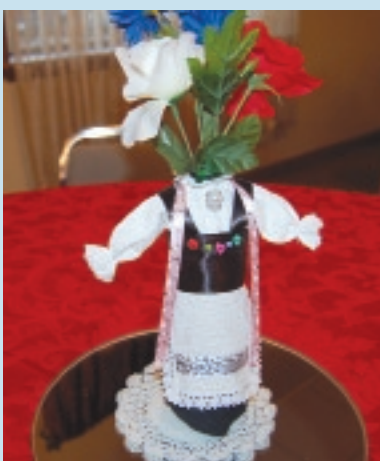
Siebenbürger Tracht centerpiece