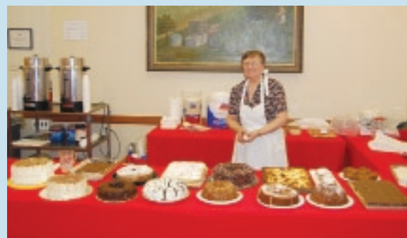
Kuchen, Kuchen, and more Kuchen. Yummy!