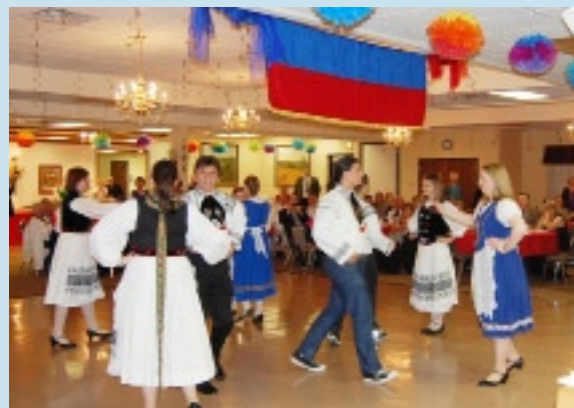
Folk dancing at its finest!