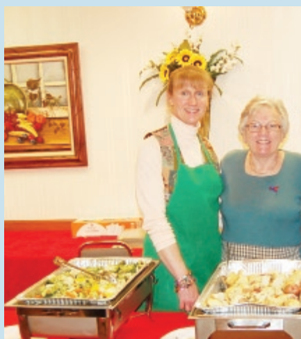
Komm und ess!