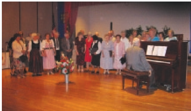
GBU Saxonia Rheingold Chor