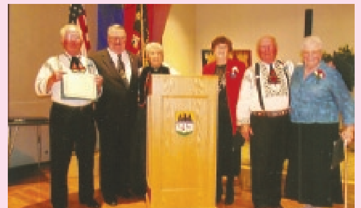
Five members receiving 50 year awards