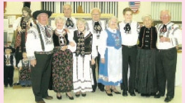
Br. 37 Members in the Saxon Tracht