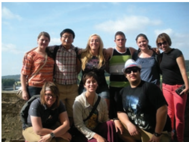
OUR USA PARTICIPANTS