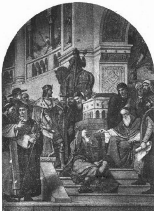
King Ludwig and his time

The articles which the tradesmen produced had to be sold, so commerce began to flourish, too. At that time the Cape of Good Hope had not yet been circumnavigated, and all the