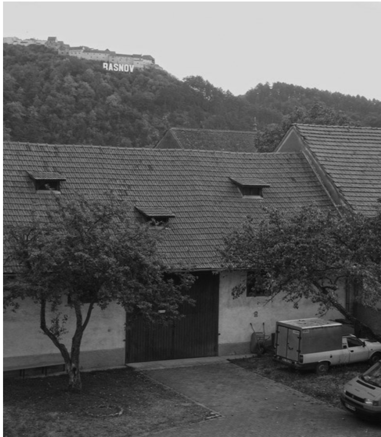
Blick auf die Rosenauer Bauernburg aus dem Hof der Saxonía.

In erster Linie, weil das Anwesen hier in Rosenau – im Unterschied zum Geschäftssitz in Kronstadt – uns gehört. Die