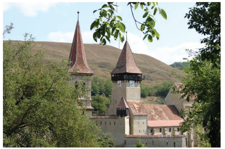
Die Kleinschelker Kirche

auf, zeigten Tänze, trugen Lieder und extra zum diesem Anlass geschriebene Gedichte vor. Anschließend nutzten die jetzigen Lehrer das 100. Jubiläum der Schule als Anlass, um die ehemaligen Schüler in ihre Klassen einzuladen. Viele folgten der Einladung und machten Fotos nach Jahrgängen. Zu diesem Thema hatte auch Pfarrer Servatius-Depner einen Beitrag: Er hat alte Presbyterialprotokolle vom Bau der Schule 1912 gefunden. Zum Nachlesen stehen sie jetzt im Internet unter www.kleinschelken.de bereit.