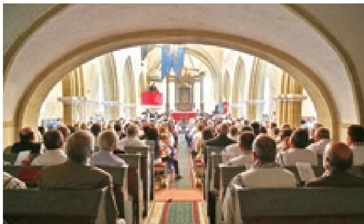
Das Treffen begann mit einem traditionellen Gottesdienst in der vollbesetzten Katharinenkirche in Kleinschelken.