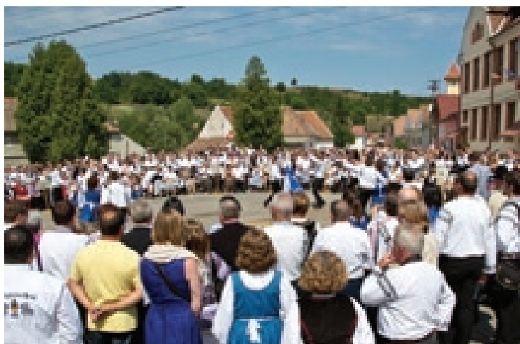
Die Gäste stellten sich wie früher nach den 14 Nachbarschaften geordnet auf dem Marktplatz von Kleinschelken auf.