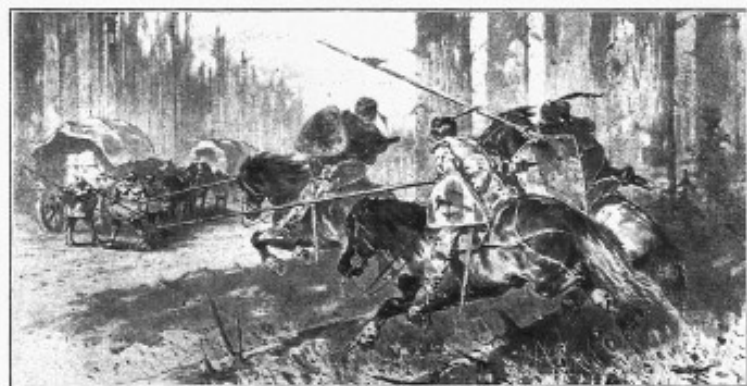
Saxon merchants often had to defend wares against robbers....

Reservations due by Tuesday October 9th by calling Flo Spack at (330) 337-3652