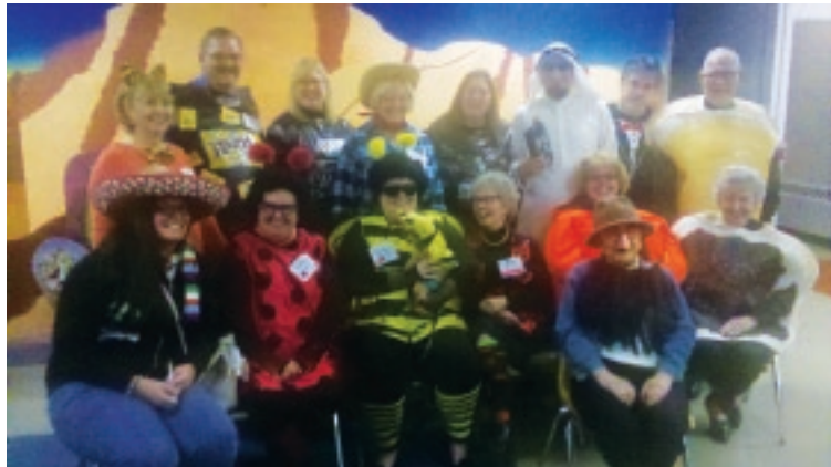
Branch 33 members having some Halloween fun

Our next meeting will be on Wednesday, November 12, at St. John's Lutheran Church on Ford Road in Highland Heights. We are asking members to bring