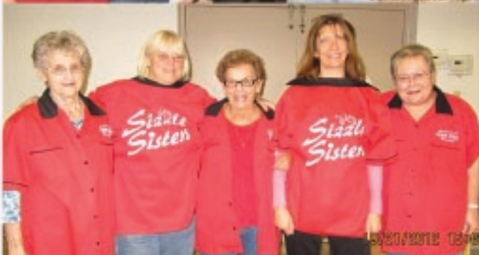
Love those smiling faces of the Merrillville Teams