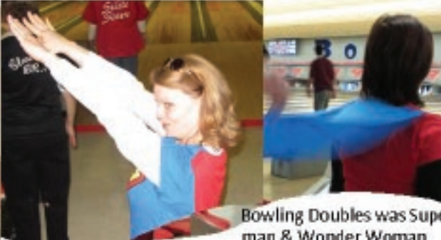
Bowling Doubles was Superman & Wonder Woman