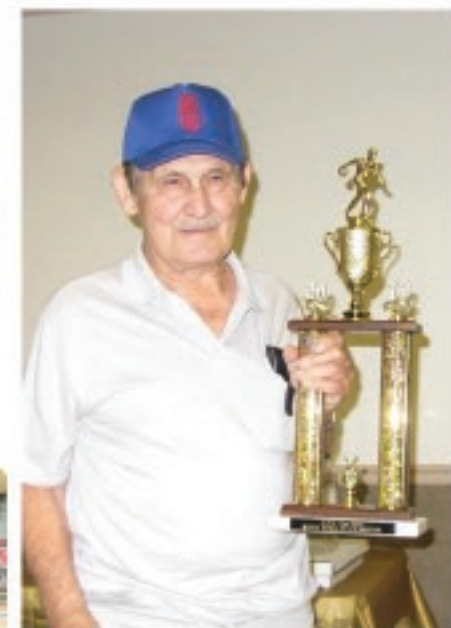
First Place Men's Singles: