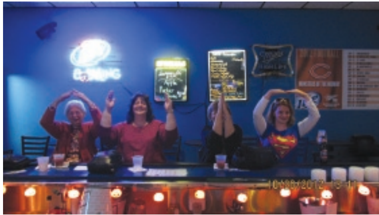
Of course, the ATS Ohio State Cheerleaders attended the ATS Open-Bowling Tournament. And they did a mighty good job cheering on the team!