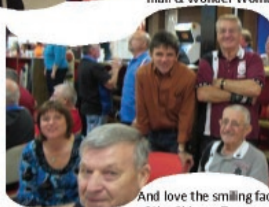
And love the smiling faces of the Chicago Team.