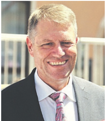
Klaus Johannis at the Heimattag der Siebenbürger Sachsen 2014 in Dinkelsbühl

On November 16, 2014 Klaus Johannis, the 55 year old Transylvanian Saxon mayor of Hermannstadt (Sibiu), was elected President of Romania.